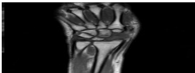
Figure 2 - MRI of wrist showed resorption of proximal three fourths of scaphoid with soft tissue involvements.